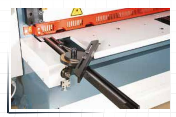
Adjustable Angle Stop 0-180° Finger Guard Ball Transfer Table Hold Downs with Rubber

Backlash-free operation high torques at operating cycles Maintanence free