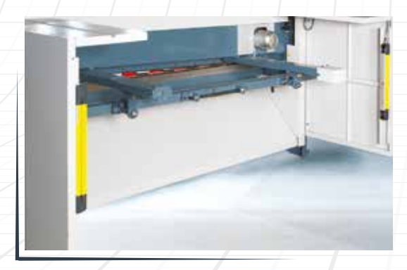
Curtain Light Guards